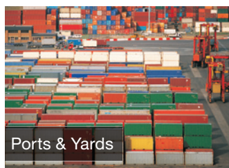
Ports & Yards