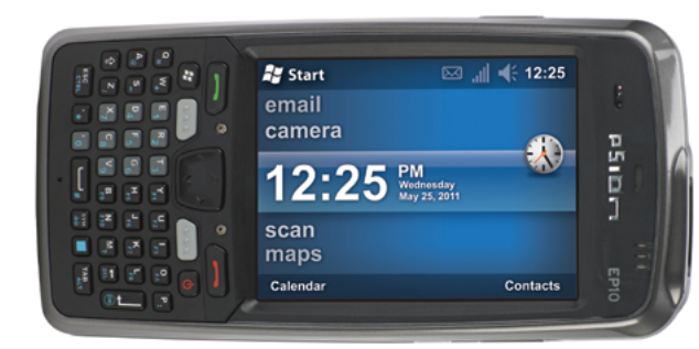
The EP10's built-in accelerometer enables the display to rotate based on the orientation of the device.

EP10's built-in interactive sensors enable mobile employees to work smarter with its context-aware computing. It is packed with everything from proximity and light sensors to an accelerometer, gyroscope, digital compass and GPS, allowing for automatic backlighting, screen rotation and accurate data geotagging capabilities.